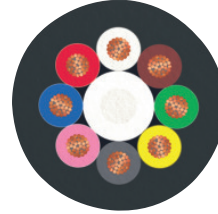
PUR halogen-free black [PUR]