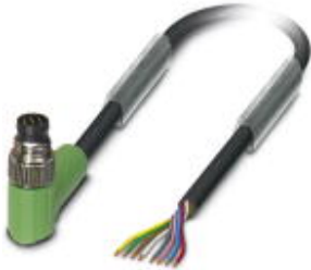
Sensor/Actuator cable, 8-position, PUR, Black RAL 9005, Plug angled M8, on Free cable end, Cable length: 10 m

Please be informed that the data shown in this PDF Document is generated from our Online Catalog. Please find the complete data in the user's documentation. Our General Terms of Use for Downloads are valid ( http://download.phoenixcontact.com )